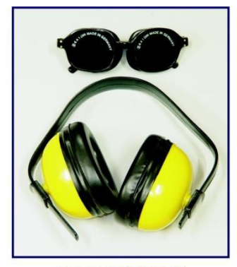
EAR MUFF & PROTECTIVE GOOGLE